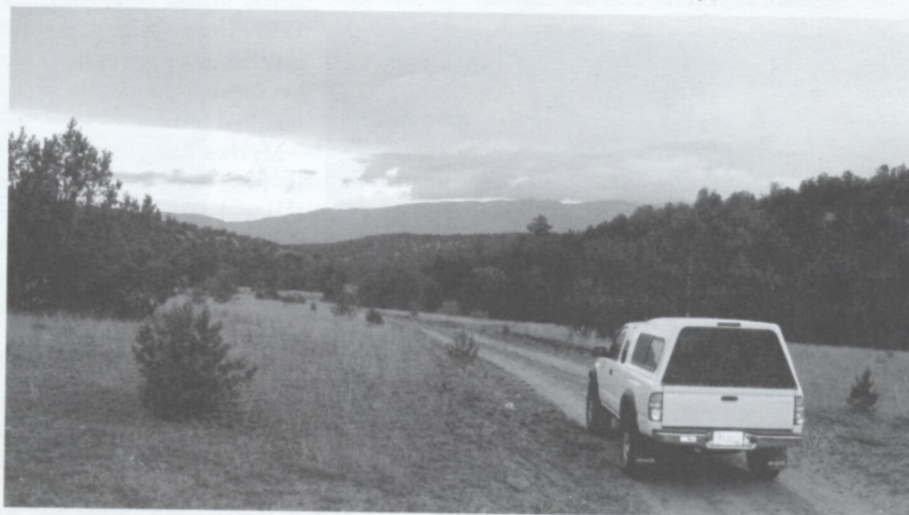
Uplands south of the Fort Stanton Cave entrance.

A poorly-documented story holds that around the time the fort was established, a party of Indians was tracked to the cave and assumed to have taken refuge there, but later appeared on the surface by some unknown route. This has led to speculation about a second entrance, for which no good evidence has ever been found. If the tale is factual at all, the tracks were more likely a ruse and the Indian group had never really hidden in the cave.