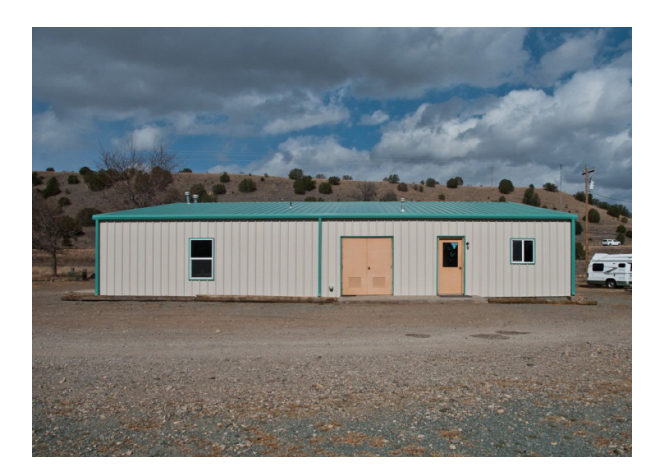
Figure 4. Field House leased by the BLM and used as an expedition headquarters by the FSCSP.